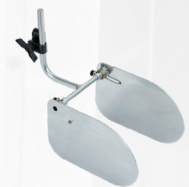
WindGuard Spray Shield