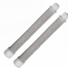
White 60 Mesh Filters (2-pack)