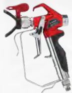
RX-Pro 2-Finger Gun with 517 Tip