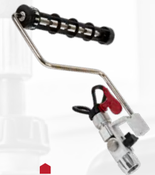
SprayRoller with 517 Tip