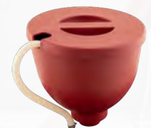
Elite 2000 Hopper