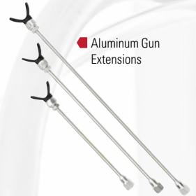
Aluminum Gun Extensions